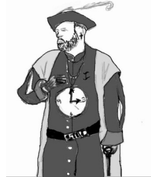
Illustration By Natalia

Illustration of IzzanBad the down with it time brother from a parallel world